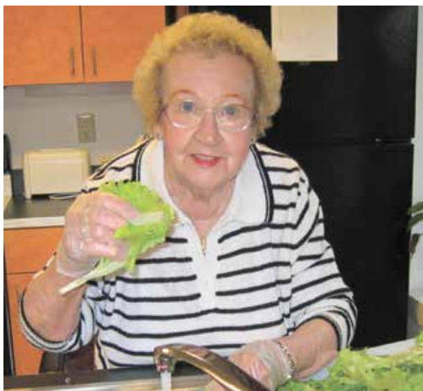
Fig. 1-8. The Eden Alternative focuses on eliminating boredom, loneliness, and helplessness by promoting meaningful elder care.

The Eden Alternative offers education, resources, and consulting services to help create meaningful environments for the elderly. Places that have adopted the Eden Alternative's philosophy are typically filled with plants and animals. Children regularly visit. The Eden Alternative strives to improve the quality of life and quality of care for the elderly (Fig. 1-8). Their website, edenalt.org, has more information.