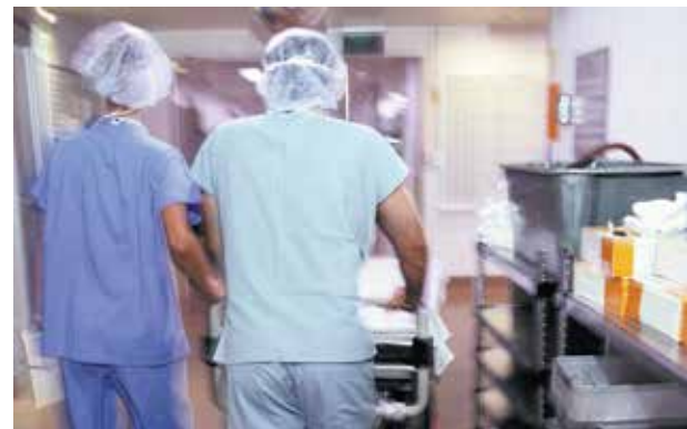
Fig. 1-3. Acute care is performed in hospitals for illnesses or injuries that require immediate care.