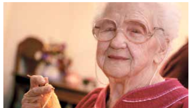
Fig. 1-1. Long-term care is given to people who need skilled care for ongoing conditions. People who live in long-term care facilities are called residents.

Most people who live in long-term care facilities have chronic conditions. This means the conditions last a long period of time, even a lifetime. Chronic conditions include physical disabilities, heart disease, and dementia. (Chapter 18 has information about these disorders and diseases.) People who live in these facilities are usually referred to as residents because the facility is where they reside or live. These places are their homes for the duration of their stay (Fig. 1-1).