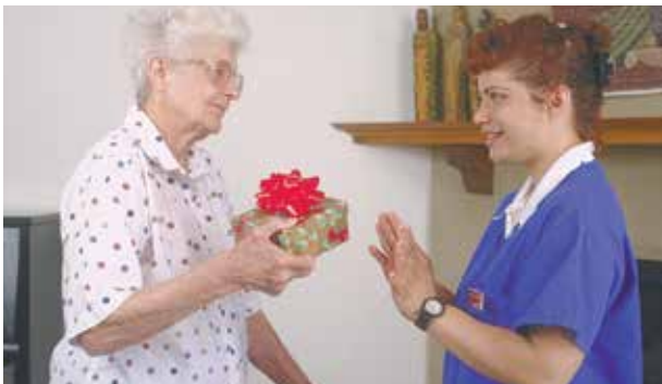
Fig. 1-6. Nursing assistants should not accept money or gifts because it is unprofessional and may lead to conflict.

Employers will have policies and procedures for every resident care situation. These have been developed to give quality care and protect resident safety. Written procedures may seem long and complicated, but each step is important. It is essential that nursing assistants become familiar with and always follow policies and procedures.