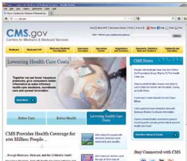
Fig. 1-7. The CMS website is cms.gov.

The Centers for Medicare & Medicaid Services (CMS) is a federal agency within the U.S. Department of Health and Human Services (Fig. 1-7). CMS runs two national healthcare programs—Medicare and Medicaid. They both help pay for health care and health insurance for millions of Americans. CMS has many other responsibilities as well.