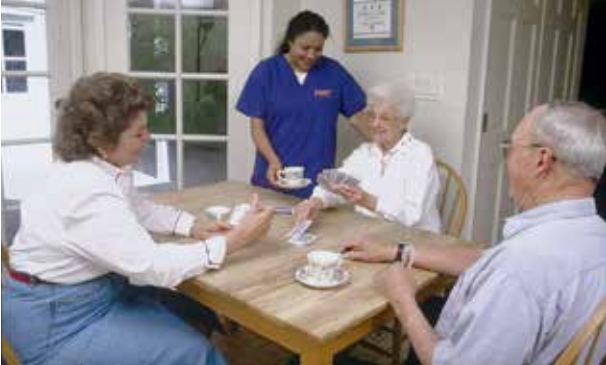
Fig. 1-2. Home care is performed in a person's home. People receiving home care are generally referred to as clients.

Home health care is provided in a person's home (Fig. 1-2). This type of care is also generally given to people who are older and are chronically ill but who are able to and wish to remain at home. Home care may also be needed when a person is weak after a recent hospital stay. Skilled assistance or monitoring may be required. People who receive home care are usually referred to as clients .