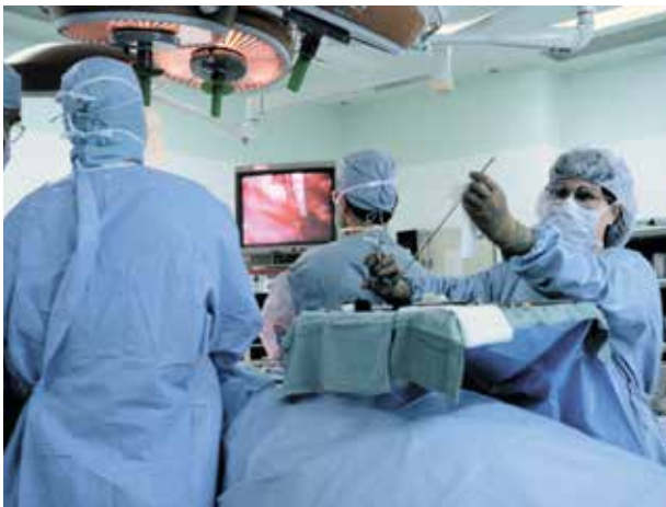
Fig. 1-4. Technology makes it possible to offer better health care, but equipment can be expensive.

HMOs and PPOs continue to replace traditional insurance plans. This affects the amount and quality of health care provided. These cost control strategies are often called managed care . In the past, the goal of health care was to make sick people well. Today it is to get sick people well in the most efficient (least expensive) way possible. Developments such as the PPACA's Affordable Insurance Exchanges, which are slated to begin in 2014, are sure to bring further changes to health care and healthcare coverage. The goal of these changes is to make coverage more accessible, affordable, and effective.