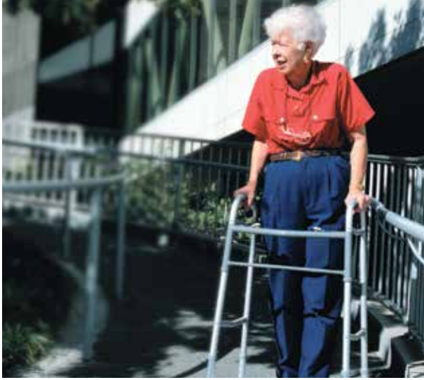
Fig. 1-5. White, non-Hispanic women make up a high percentage of residents in long-term care facilities.

The length of stay of over two-thirds of residents in long-term care is six months or longer. These residents need enough help with their activities of daily living to require 24-hour care. Often, they do not have caregivers available to give sufficient care for them to live in the community. The groups with the longest average stay are the developmentally disabled. They are often younger than 65. More information about these groups is found in Chapter 8.