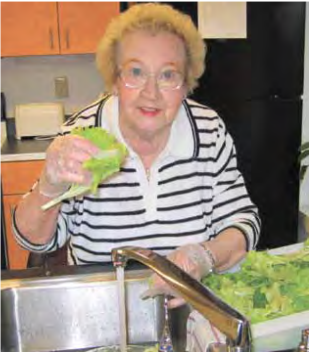
Fig. 1-8. The Eden Alternative focuses on eliminating boredom, loneliness, and helplessness by promoting meaningful elder care.

The Eden Alternative offers education, resources, and consulting services to help create meaningful environments for the elderly. Places that have adopted the Eden Alternative's philosophy are typically filled with plants and animals. Children regularly visit. The Eden Alternative strives to improve the quality of life and quality of care for the elderly (Fig. 1-8). For more information about this organization, visit their website at edenalt.org .