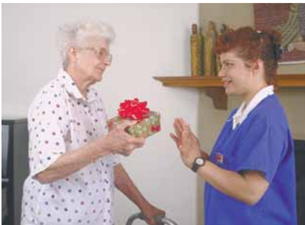
Fig. 1-6. Nursing assistants should not accept money or gifts because it is unprofessional and may lead to conflict.

Employers will have policies and procedures for every resident care situation. These have been developed to give quality care and protect resident safety. Written procedures may seem long and complicated, but each step is important. It is essential that nursing assistants become familiar with and always follow policies and procedures.