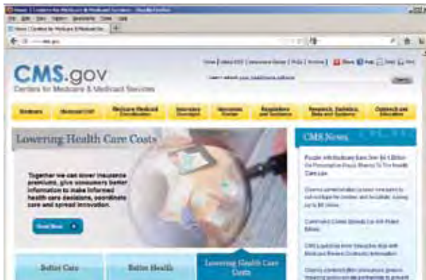
Fig. 1-7. The CMS website's address is cms.gov .

The Centers for Medicare & Medicaid Services (CMS) is a federal agency within the U.S. Department of Health and Human Services (Fig. 1-7). CMS runs two national healthcare programs—Medicare and Medicaid. They both help pay for health care and health insurance for millions of Americans. CMS has many other responsibilities as well.