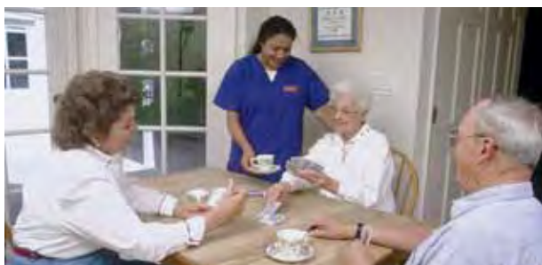
Fig. 1-2. Home care is performed in a person's home. People receiving home care are generally referred to as clients .

Home health care is provided in a person's home (Fig. 1-2). This type of care is also generally given to people who are older and are chronically ill but who are able to and wish to remain at home. Home health care may also be needed when a person is weak after a recent hospital stay. Skilled assistance or monitoring may be required. People who receive home health care are usually referred to as clients .