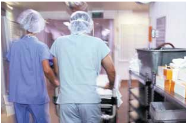
Fig. 1-3. Acute care is performed in hospitals for illnesses or injuries that require immediate care.

Often payers control the amount and types of healthcare services people receive. The kind of care a person receives and where he receives it may depend, in part, on who is paying for it. Traditional insurance companies offer plans that pay for the health care of plan members. Most people covered by traditional insurance are part of a plan at their place of work. The costs are paid for by the employer, the employee, or shared by both. Starting in 2014 the federal