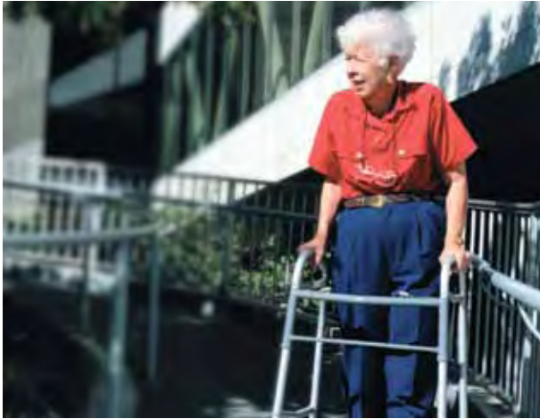
Fig. 1-5. White, non-Hispanic women make up a high percentage of residents in long-term care facilities.

over 50 percent come from a hospital or other facility.