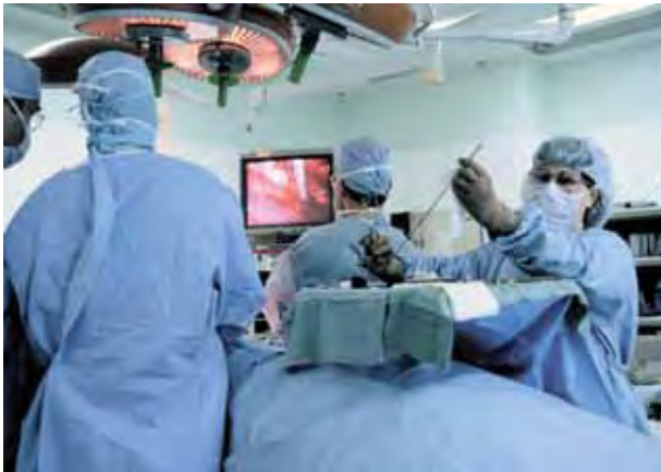
Fig. 1-4. Technology makes it possible to offer better health care, but equipment can be expensive.

Our healthcare system is constantly changing. As we develop new and better ways of caring for people, care becomes more expensive. Better health care helps people live longer, which leads to a larger elderly population that may need additional health care. New discoveries and expensive equipment have also increased healthcare costs (Fig. 1-4).